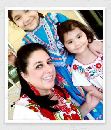
Guilford Elem. Multicultural Celebration 😯