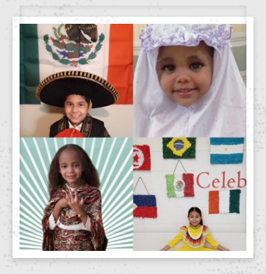
Guilford Elem. Multicultural Celebration 🚱