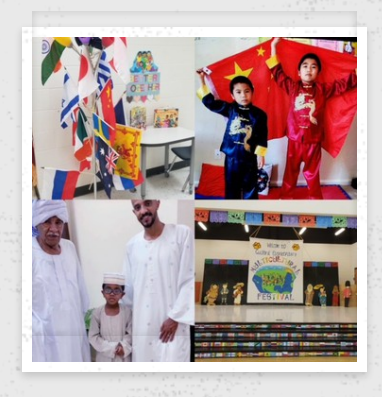
Guilford Elem. Multicultural Celebration 🖫

Southern Elementary Celebrates Day of the Dead by honoring Hispanic Heritage. There was a Quinceañera, dancing, masks and food.